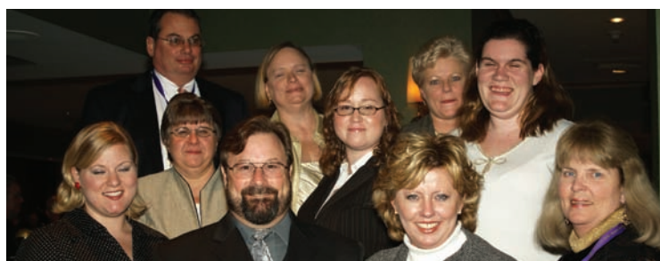
The "Tony" award group from Athens State University