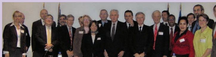
All the attendees at the Conference

The expansion of U.S. accrediting entities and professional societies have spurred the spread of honor societies beyond U.S. borders. The Association of Collegiate Business Schools and Program (ACBSP), with whom DMD is affiliated, has aggressively pursued a global expansion into Canada, Europe, Latin America, and Russia. ACBSP Region 8, in fact, is made up totally of institutions outside North America. Naturally, Delta Mu Delta is interested in joining in this expansion and the DMD Board has made a commitment to this effort by designating the experience of the position of Immediate Past President to also serve as the Region 8 International Representative.