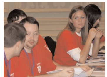
On Friday attendees wore school logo shirts.